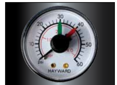
Pressure and Cleaning Gauge